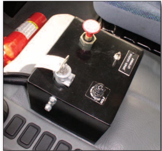
Centrally relocated controls to use from either side.