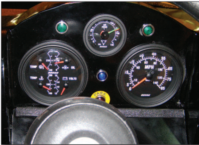
Optional: Right side gauge package.