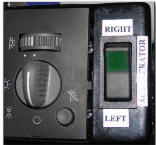
Accelerator switch between right or left operator.