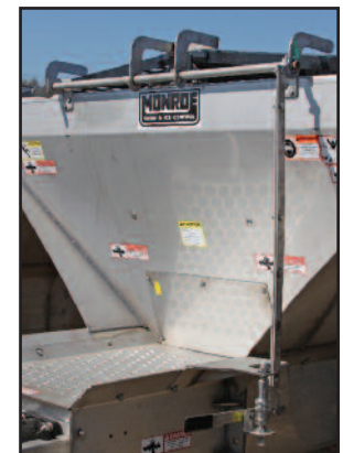
Hydraulic Interlock System