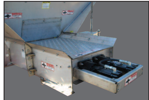
Dual Auger Bolt-On Tail Section