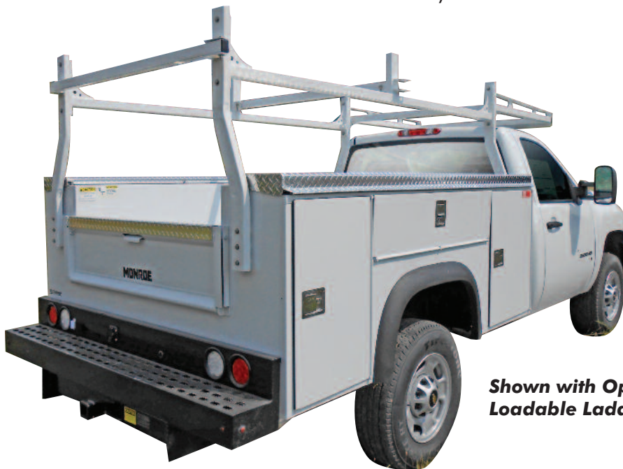
Shown with Optional Forklift Loadable Ladder Rack