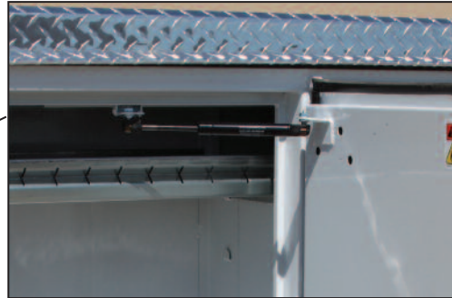
Nitrogen Gas Strut Door Holders