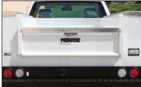
Slam Action Tailgate