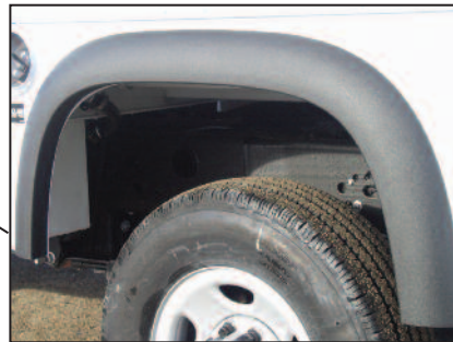
Poly Carbonate Fender Flares