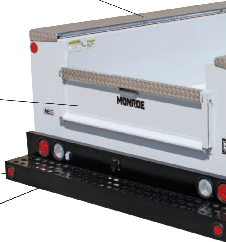
FMVSS Compliant Lighting

MTE "Pooched" Bumper with Black Powder Coat Finish. Bumper Mounting Plates are Reinforced for Optional Add-On Receiver Hitch Mounting.